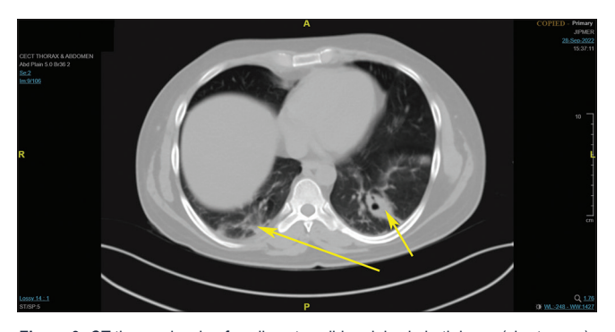
Figure 3: CT thorax showing few discrete solid nodules in both lungs (short arrow), predominantly in the periphery. Patchy areas of consolidation are seen in poster basal segments of bilateral lower lobes (long arrow)

Blood culture should be performed for all suspected cases, and growth of B. pseudomallei from the culture of any site is diagnostic of melioidosis. Blood culture has an estimated sensitivity of about 50%–60% for melioidosis. On microscopy, the bacillus has characteristic bipolar staining with a safety pin appearance. Treatment consists of an intensive phase with IV antibiotics for at least 14 days, followed by an eradication phase with oral antibiotics for 3 months to prevent relapse. For critically ill patients and patients with central nervous system (CNS) involvement, meropenem is the drug of choice. In noncritically ill