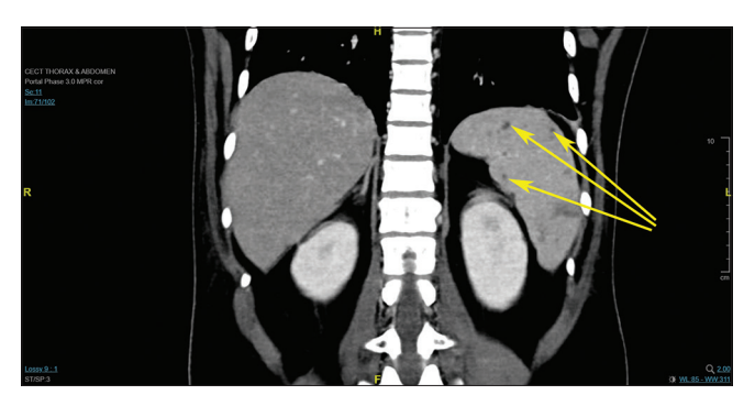
Figure 2: Coronal reconstruction of the CECT abdomen showing numerous small hypodense non-enhancing lesions scattered throughout the spleen (yellow arrows), the largest measuring 2.2x1cm in the lower pole, extending up to the subcapsular region