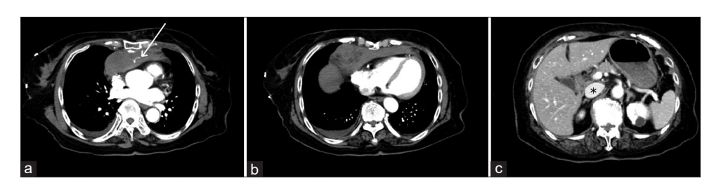
Figure 1: Contrast-enhanced computed tomography when signs of shock were seen. (a) Extravasation from a branch of the internal thoracic artery (white arrow), (b) Mediastinal hematoma compressing the heart, (c) Inferior vena cava dilated with a diameter of 31.7 mm × 19.9 mm (asterisk)