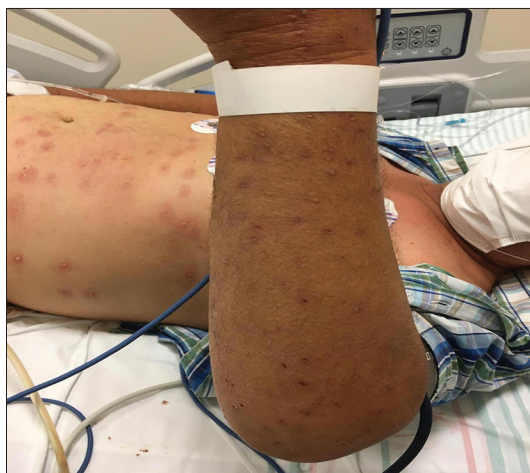
Figure 1: His physical examination revealed pustular lesions distributed across his chest and arms, marking the sting zones