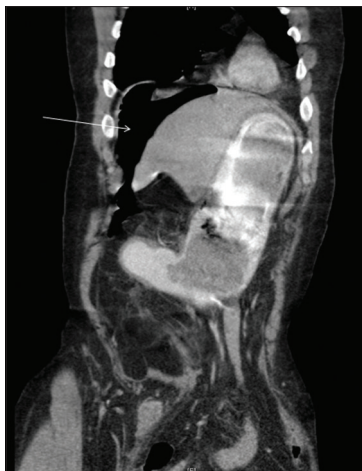
Figure 1: Sagittal view showing free air in the abdomen (arrow)

Giant inguinoscrotal hernias are described as hernias extending below the midpoint of the inner thigh in the