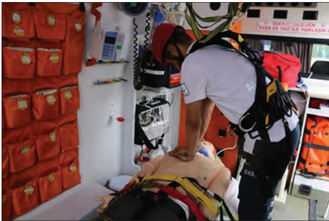
Figure 1: Application of chest compressions to the training model in an ambulance by paramedics and the safety measures taken

ambulance (Mercedes Sprinter®, 2015, Germany) from the EMS of Ankara city was used. To ensure standardization, the ambulance was driven by the same ambulance driving trainer each time. Before the start, the driver was allowed to take five practice laps to get used to the driving track. During the study, the drivers were asked to go as fast as they could, but they reached a maximum speed of 40 km/h to ensure ambulance paramedics safety. The speed was up to 40 km/h on the straight-ahead route, while the maximum speed was 20 km/h in the maneuvering areas.