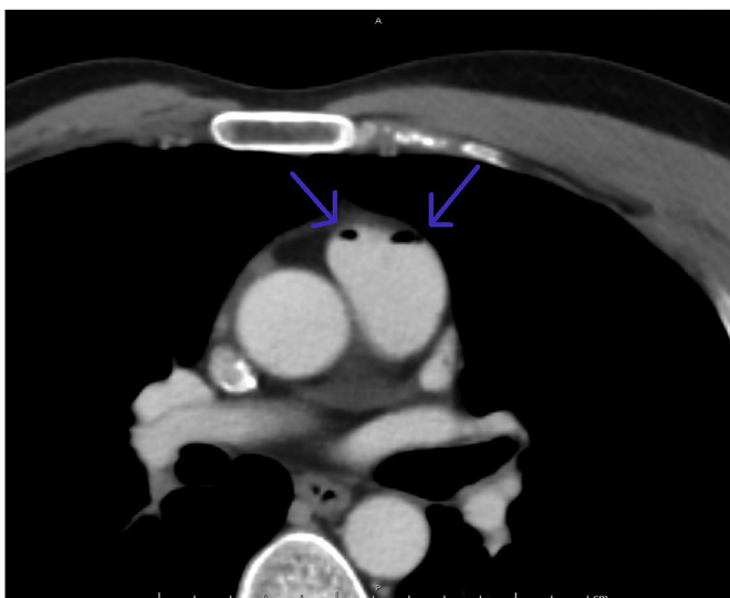
Fig. 1. Axial contrast-enhanced chest computed tomography image showing in the main pulmonary artery air bubbles (arrows).