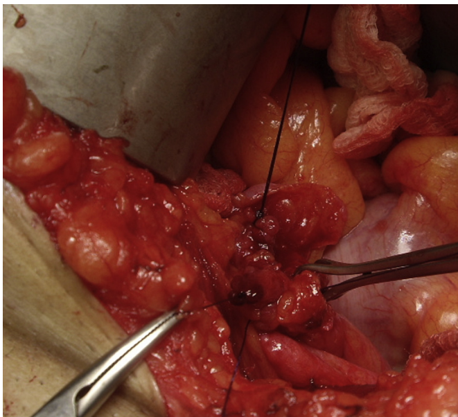
Fig. 2. Laparotomy confirmed the presence of a 10 cm intra-peritoneal rupture of the dome of the urinary bladder which was closed in 2 layers using Vicryl 3/0.

The association of presence of intra-peritoneal fluid and hypotension usually indicates intra-abdominal bleeding. Our patient was not hypotensive on presentation despite the presence of significant intra-peritoneal fluid. The injury occurred three days before presentation and the patient was hemodynamically stable. Despite that, intra-abdominal bleeding could not be completely ruled out. The change of FAST examination from a positive to a negative study combined with drainage of a large amount of clear urine through the Foley catheter was diagnostic of a major intra-peritoneal urinary bladder rupture. Abdominal ultrasound can detect as little as 10 ml of intra-abdominal fluid by experienced hands although up to 1 L may be needed to be detected by a non experienced operator. 8,9 The second operator, who is highly experienced in performing POCUS, was surprised to find that FAST was completely negative. To reach proper diagnosis, he directly spoke with the first operator who confirmed that he was highly confident of his positive results. The patients' sitting position in the bed, the large unexplained amount of urine in the urinary bag, the experience of both operators, and thinking outside the box all helped in reaching the diagnosis of a major intra-peritoneal urinary bladder rupture that permitted complete drainage of the intra-peritoneal fluid through the urinary catheter. We are not aware of a similar case in the literature where indirect ultrasound findings were