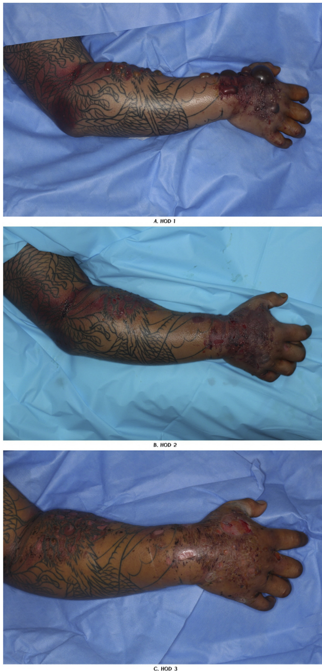
Fig. 3. Changes in local wound status according to the treatments (A: First hospital day, B: Second hospital day, C: Seventh hospital day). Swelling and hemorrhage remarkably improved with time.

administration of Kovax ® and the patient gradually recovered from the envenomation over several days. We assumed that the administration of antivenom for the venom of another subfamily of snake treated the envenomation successfully through cross-neutralization.