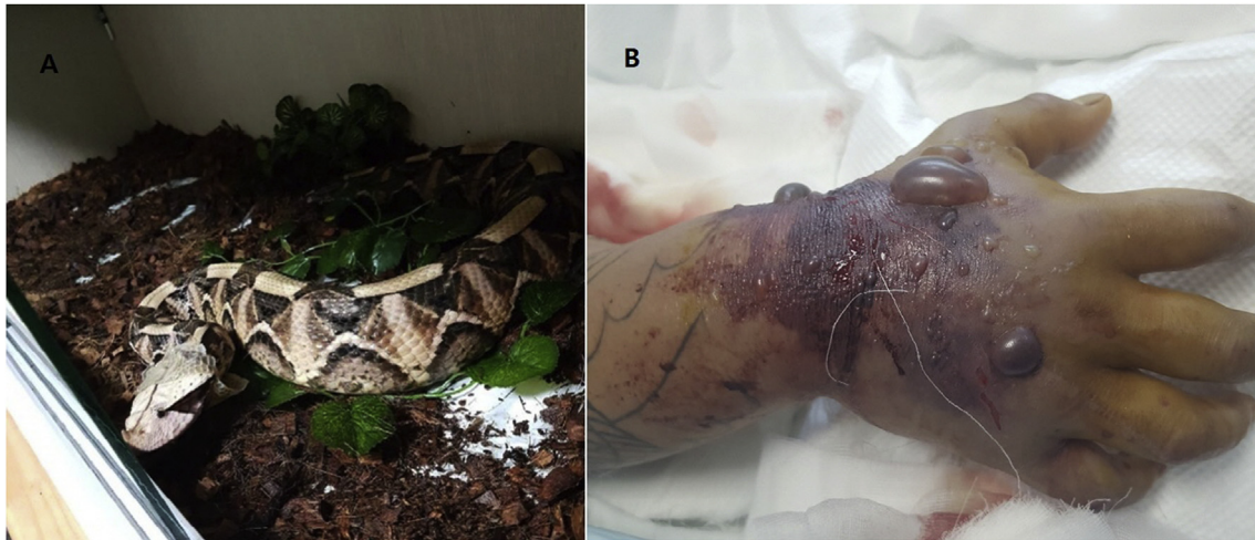
Fig. 1. The culprit snake (A) and biting site (B).

A. The Gaboon viper has typically a tiny pair of horns between the nostrils and the two stripes below the eye. B. Two large bullae around the anatomical snuff box are suspected of being the fang sites.