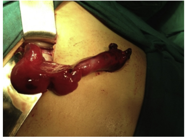
Fig. 2. Fallopian tube after detorsion and cystectomy. (case 1).

At laparotomy; uterus, right adnexa and left ovary were normal, but left fallopian tube was twisted twice around itself at clockwise direction. There was a hemorrhagic paratubal cyst 5 × 5 cm in diameter located just near to fimbria. The twisted tube was edematous with purple patchy areas suggesting early signs of ischemia (Fig. 1). The tube was untwisted and the perfusion returned back after waiting several minutes with warm wet gauzes (Fig. 2). The tubal opening was checked with a stilette, and the paratubal cyst was excised totally. The postoperative course was uneventful. Two months later, ultrasound showed normal findings. Histopathological examination revealed simple cyst lined by single layer of tubal type epithelium with hemorrhages. There were no signs of tubal or ovarian pathology during the follow-up with ultrasound for three years.