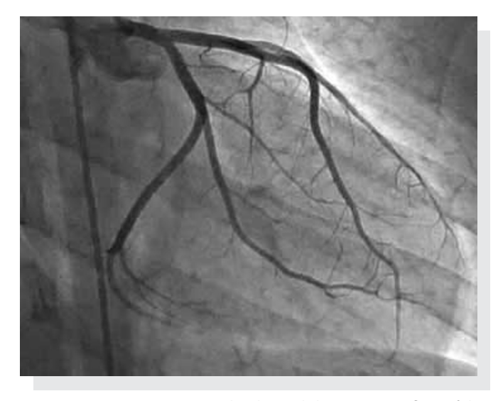
Figure 2. Coronary angiography showed slow coronary flow of the circumflex (Cx) and left anterior descending (LAD) coronary arteries.

tests performed prior to admission, which included antiphospholipid antibodies, were negative.