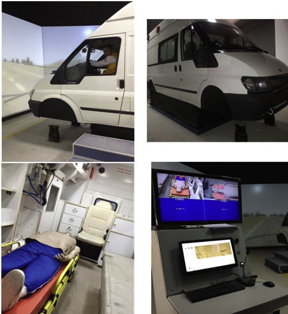
Fig. 1. Outer appearance of simulator ambulance, position of the manikin and outer command center.

considered unsuccessful after three failed attempts. For resuscitation within the ambulance, each practitioner began the respiration with a balloon valve mask (BVM) before each airway intervention. After this, at least three respiration interventions occurred when one of the assessors gave the order to start. If success could not be achieved within 60 s, then the attempt was ended. Another attempt was made after the manikin was again respiration with a BVM. If the third attempt at airway intervention was not successful, then the intervention with this method was considered unsuccessful. Time measurements were recorded with a standard chronometer (a Casio Hs-80Tw-1Df chronometer).