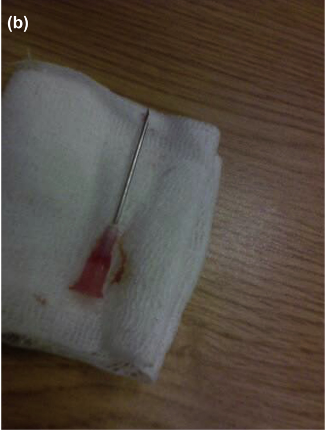
Fig. 1. (a) Hyperdense needle seen in cervical computed tomography. (b) Needle removed by endoscopy.